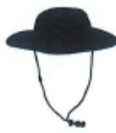
Soft Brimmed Slouch Hat