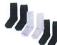
Plain Navy White or Black Ankle Socks