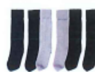
Plain Navy, White or Black Knee High Socks

Colours and images on this storyboard are representations only.