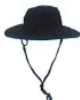
Hard Brimmed Slouch Hat