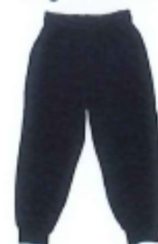
Track Pants with Cuff