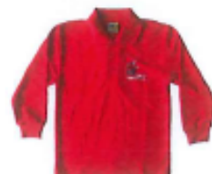
Long Sleeve Polo