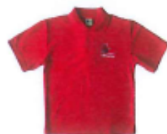
Short Sleeve Polo